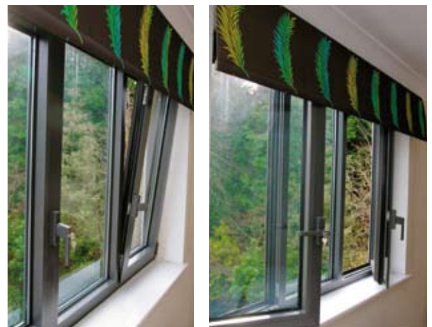
This three casement window is shown in tilt and turn positions.

security: internally operated key locking handles