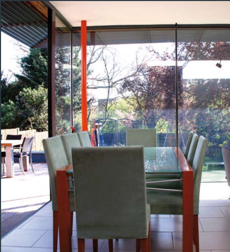
This silicone jointed Thermo60 glass wall creates a frameless look whilst maintaining high levels of thermal efficiency.