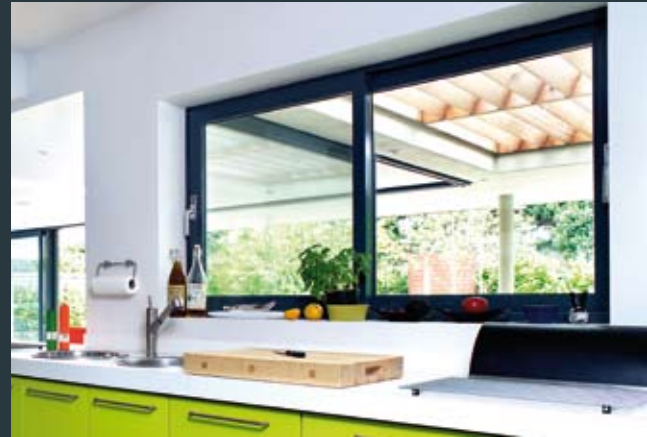
This IS041 window completes the contemporary look of this kitchen.