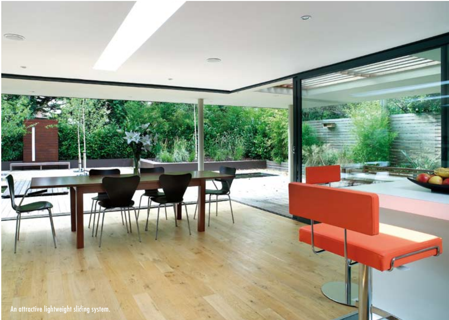
An attractive lightweight sliding system.

SLIDING DOORS SLIDING WINDOWS SLIDING DOORS SLIDING WINDOWS SLIDING DOORS