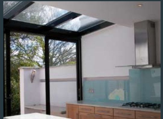
These doors are combined with our glazed roof system to allow as much natural light as possible.