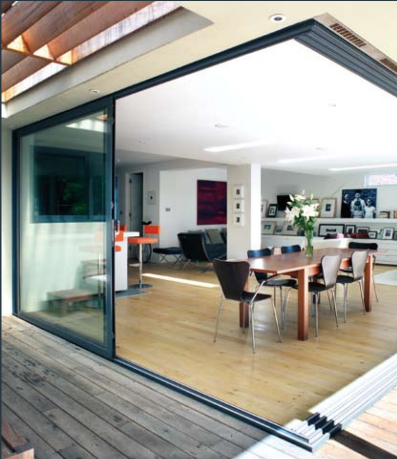
A sliding corner post has been used on this project, allowing doors to slide away from one another to reveal an impressive open corner.