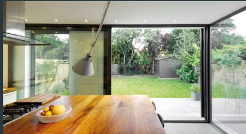
A track extension enables this Bali60 panel to slide behind a wall to open up the whole space.