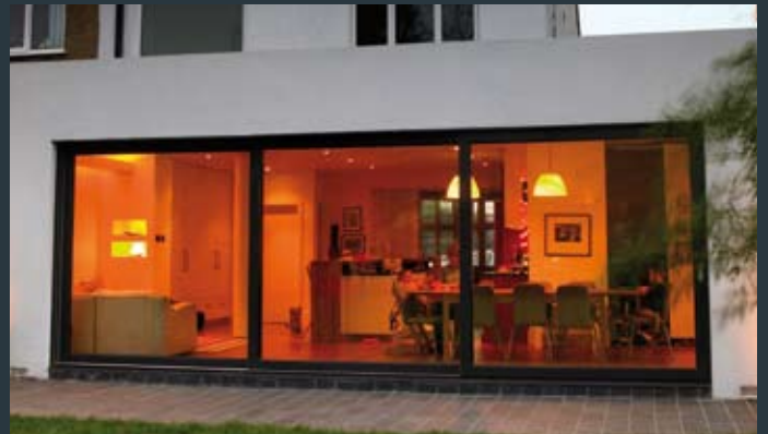
Frame your living space.