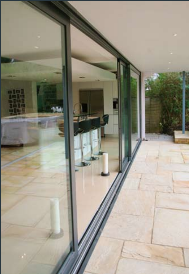
The centre panels of this Bali60 project bi-part to open up 5 metres of uninterrupted space.